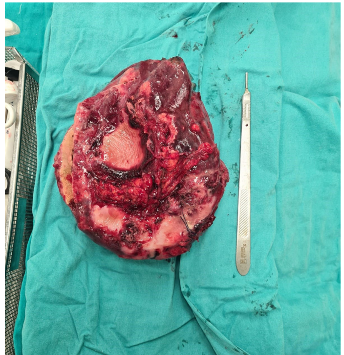
Figure 3. View of right hepatectomy